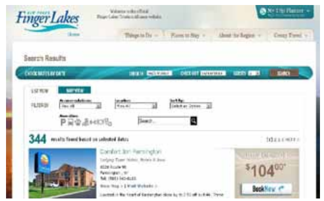
Screen shot of the Book a Room Now search feature on FingerLakes.org.

In January of 2012 the Finger Lakes Tourism Alliance rolled out the Book a Room Now feature on Finger-Lakes.org. Book a Room Now is a program through Jack Rabbit Systems that ties into an accommodation partner's current reservation system and pulls availability to display on to FingerLakes.org for visitors to search quickly and easily for their accommodation needs.