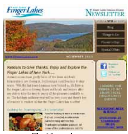
The November 2013 consumer 'public' e-newsletter

*NOTE: Email marketing efforts have been broken down by segmented lists of consumer show attendee leads in order to track effectiveness of each show and determine if FLTA was receiving qualified leads. Numbers listed here are based on FingerLakes.org information request database of over 38,000 opted in email subscribers.